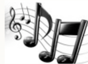
Music Only; but only the best music!

Basic is for those who just want to dance to great music as long as their legs will let them stand it! No dance floor lighting lighting with this package, but the great times come included absolutely free!